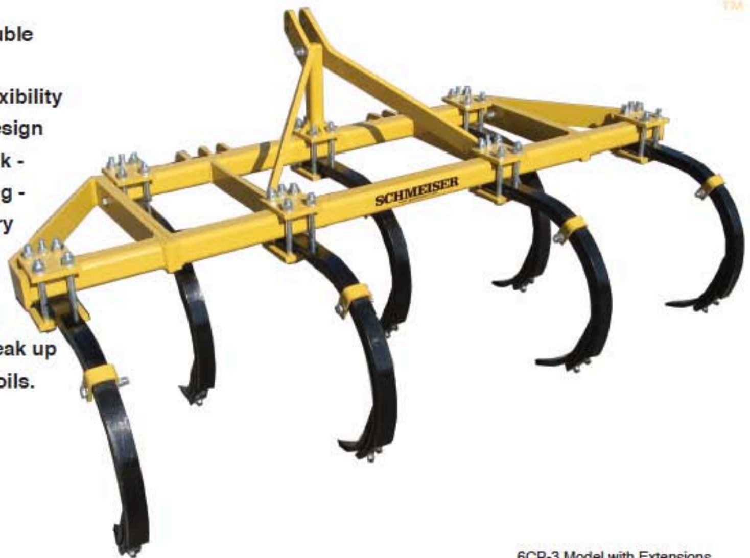
6CP-3 Model with Extensions

Schmeiser's exclusive double shank combination gives additional strength and flexibility to the Culti-Plow™. The design features a secondary shank - similar to a car's leaf spring - on the back of each primary shank. This configuration allows for deeper penetration and increased shank vibration to help break up even heavily compacted soils.