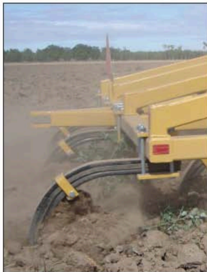
Triple Shank Assembly is standard on all 3-Bar models

Designed to meet your field's special needs - available in widths from 10' to 20'.