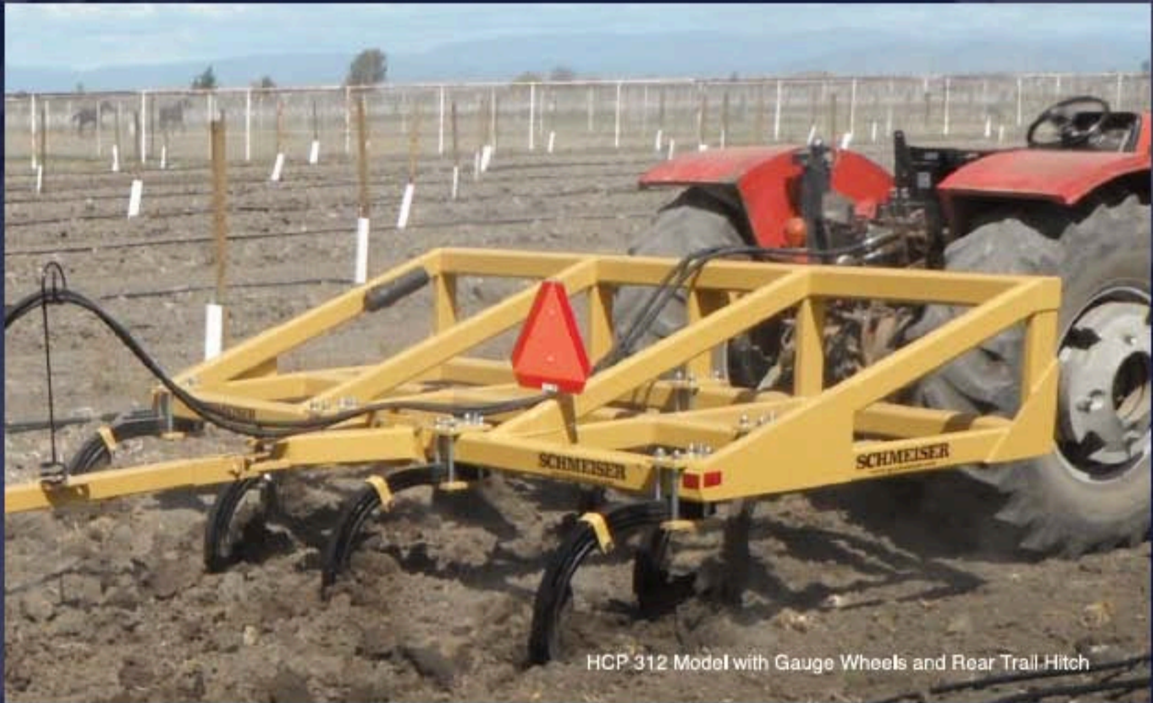
HCP 312 Model with Gauge Wheels and Rear Trail Hitch

The Schmeiser 3-Point Culti-Plow breaks up soil compaction and plow pan, providing growers with a corrugated finish that channels water to help penetrate the subsoil.