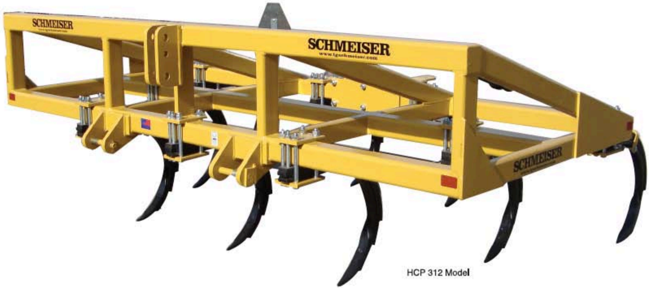
HCP 312 Model