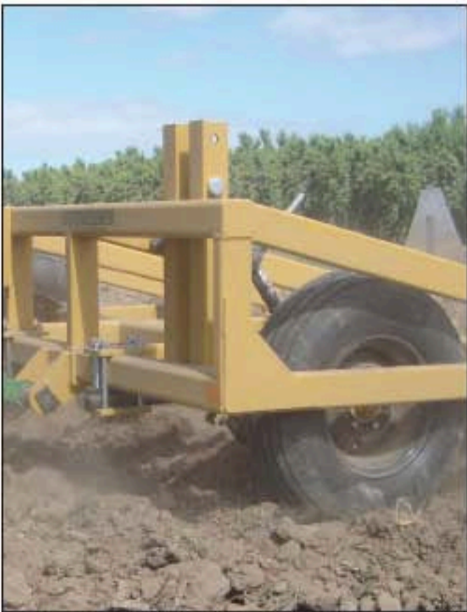
Optional Gauge Wheel Assembly